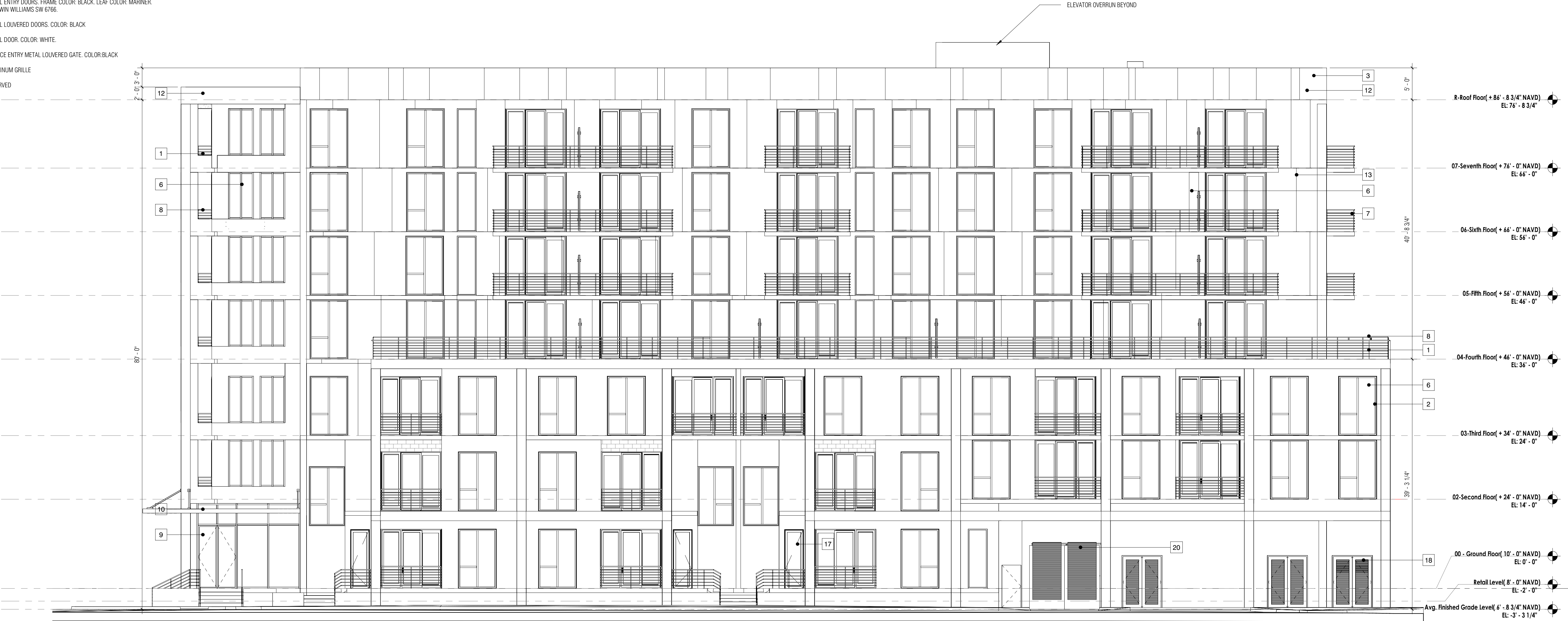
1 05 OVERALL EAST ELEVATION A - 12 Scale: 1/8" = 1'-0"